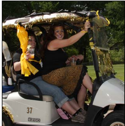
Holt of California