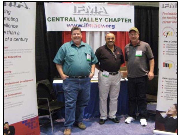
The new Central Valley Chapter of IFMA at the Modesto Facilities Expo