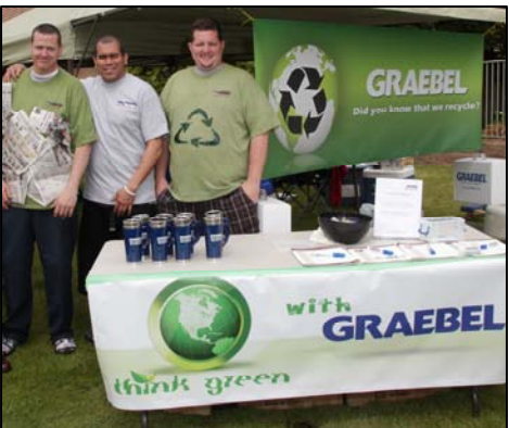
Graebel Moving and Storage