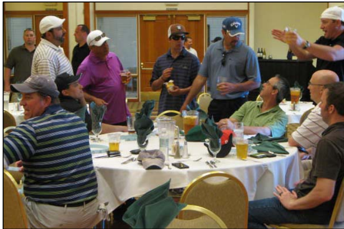
Tournament dinner reception